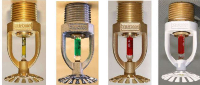
*K=5.6 (80.6) ** Casting DZR Frame, Job® Glass Bulb